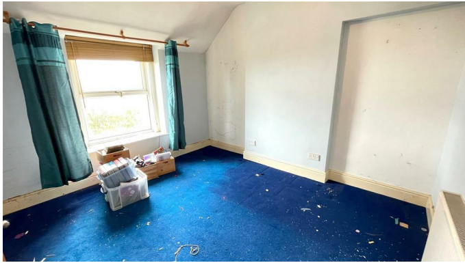
BEDROOM 1 12'2" x 12'2" (3.72m x 3.71m)

Upvc double glazed window, double radiator, built-in cupboard. Views.