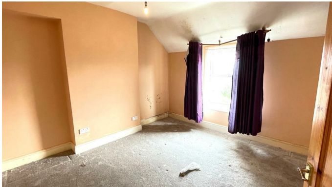
BEDROOM 2 11'10" x 10'9" (3.61m x 3.30m)

Upvc double glazed window, double radiator. Views.