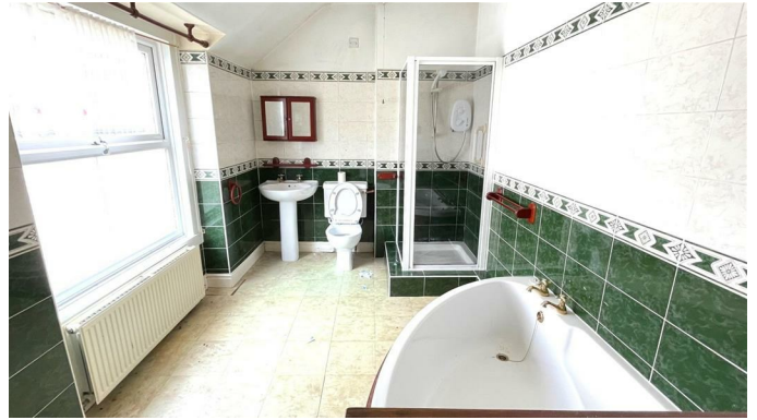
BATHROOM x 7'5" (x 2.27m)

Corner bath, separate shower cubicle with electric shower, pedestal wash hand basin and close coupled w.c, in White, wall tiling, upvc double glazed window, double radiator, boiler cupboard with 'Glow worm' gas fired central heating/hot water boiler.