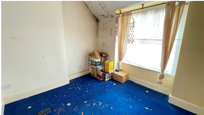
BEDROOM 3 11'6" x 8'8" (3.52m x 2.65m)

Upvc double glazed window, double radiator.