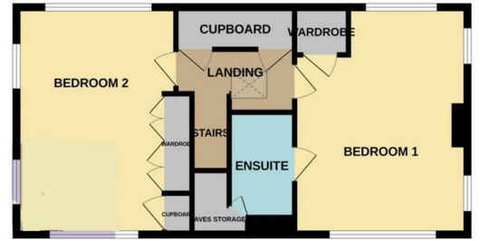
1ST FLOOR 557 sq.ft. (51.7 sq.m.) approx.