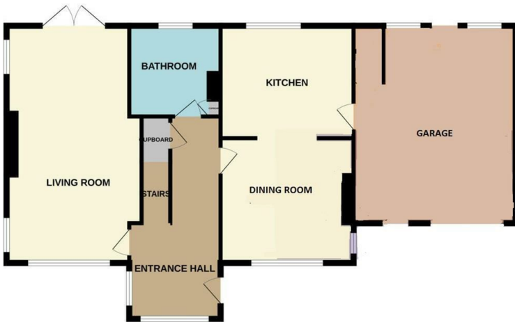
GROUND FLOOR 1104 sq.ft. (102.6 sq.m.) approx.