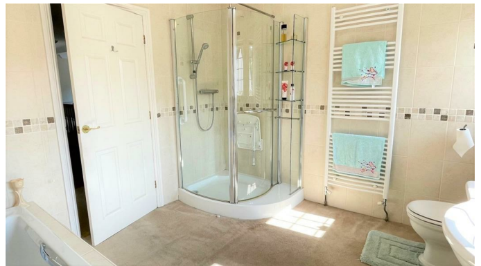
TILED 4 PIECE BATHROOM

with light and power, access to eaves storage. Potential for an en-suite to the main bedroom