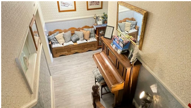
Dado rails, coving, wood effect flooring, double radiator