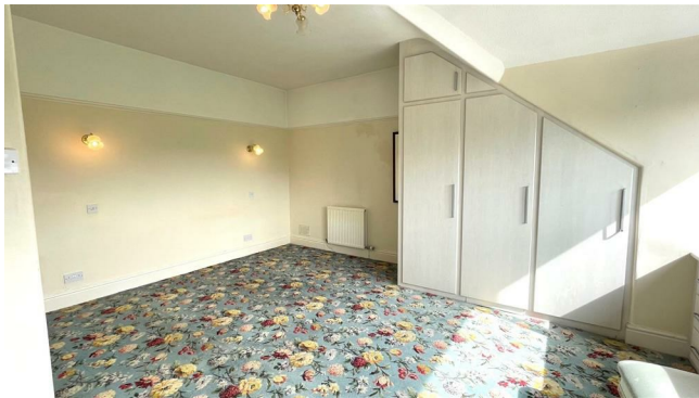
VIEW FROM BEDROOM 2

Built in wardrobes and top boxes, dressing table and drawers, walk-in storage cupboard, radiator, views over Rhos on Sea golf course and hills beyond.