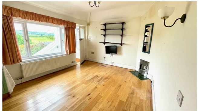
OPEN PLAN LOUNGE/KITCHEN/DINER 14'11" x 11'3" (4.57m x 3.45m)

Small inset electric fire and tiled hearth.