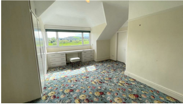
BEDROOM 2 17'4" x 15'5" (5.29m x 4.70m)

Built in wardrobes and top boxes, dressing table and drawers, walk-in storage cupboard, radiator, views over Rhos on Sea golf course and hills beyond.