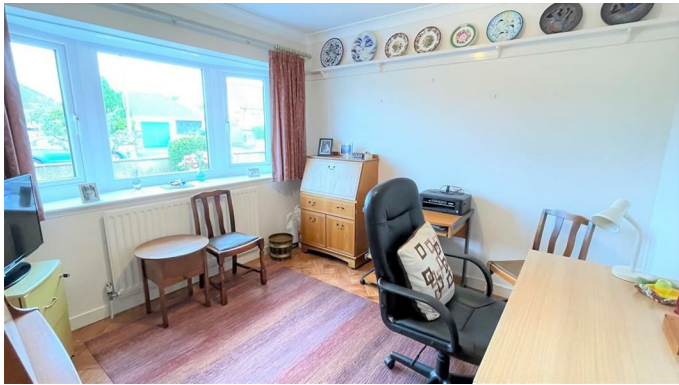
Plate rack, upvc double glazed window, radiator.