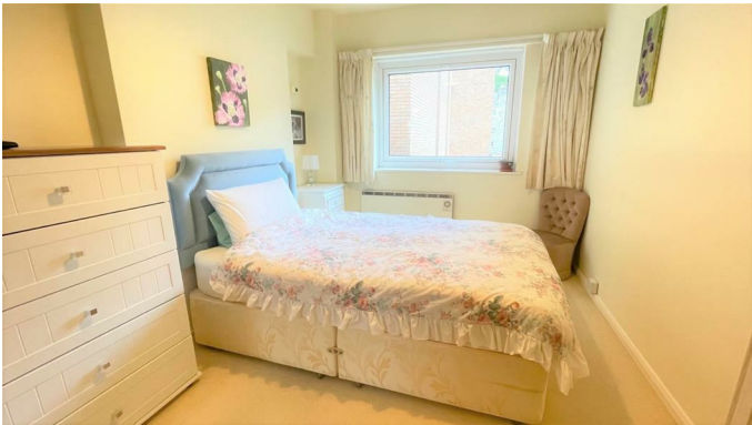
BEDROOM 2 13'3" x 9'0" (4.05m x 2.75m)

Upvc double glazed window, wall mounted electric heater