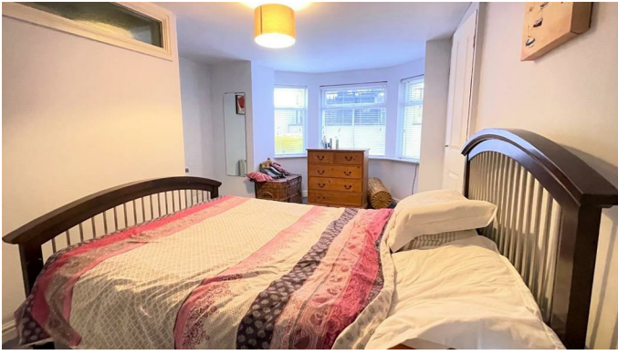
BEDROOM 2 8'5" x 6'9" (2.59m x 2.06m)