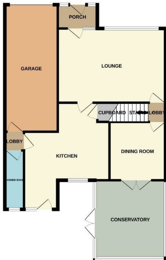
GROUND FLOOR 913 sq.ft. (84.8 sq.m.) approx.