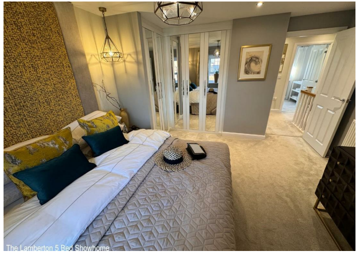
The Lamberton 5 Bed Showhome