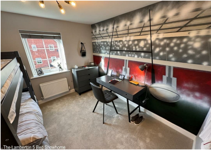
The Lamberton 5 Bed Showhome