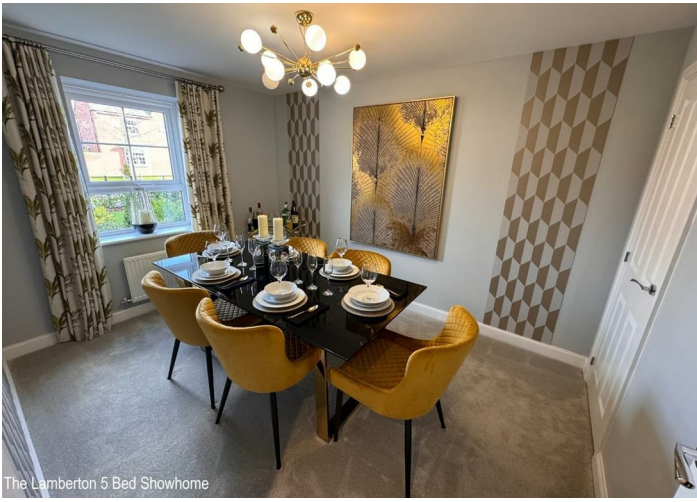
The Lamberton 5 Bed Showhome