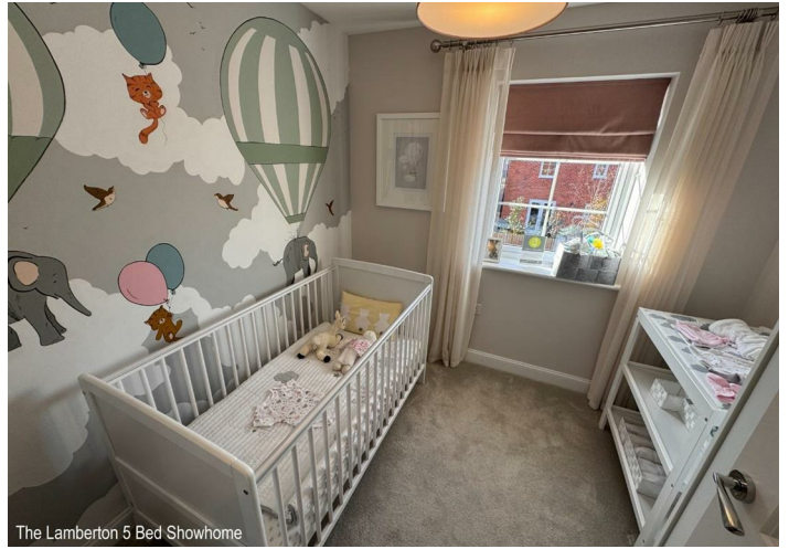
The Lamberton 5 Bed Showhome