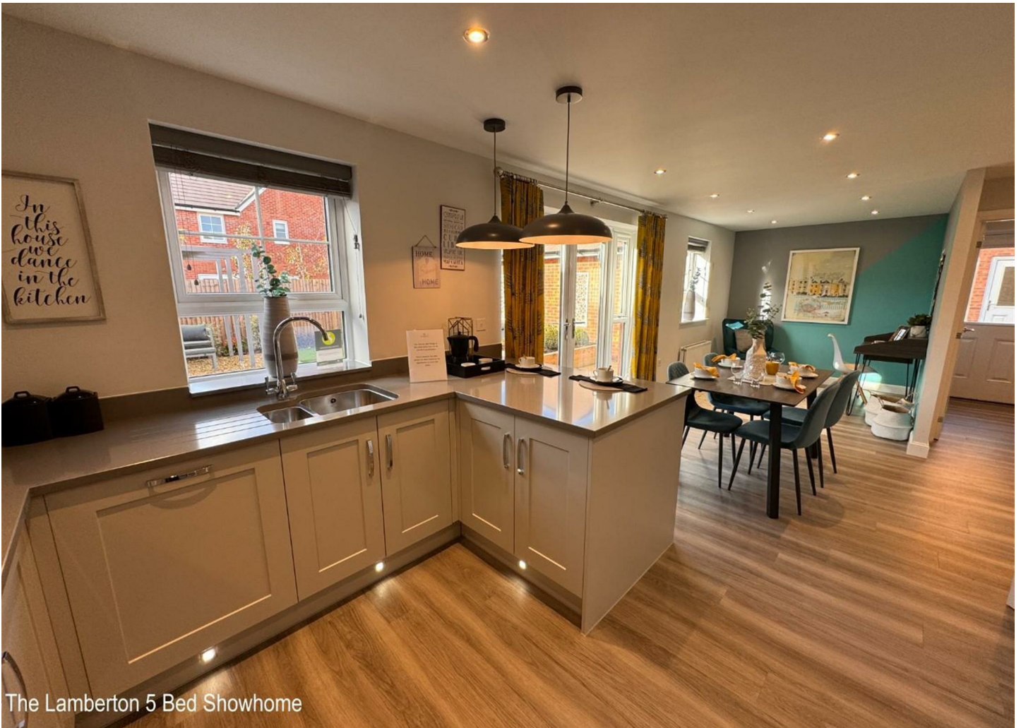
The Lamberton 5 Bed Showhome