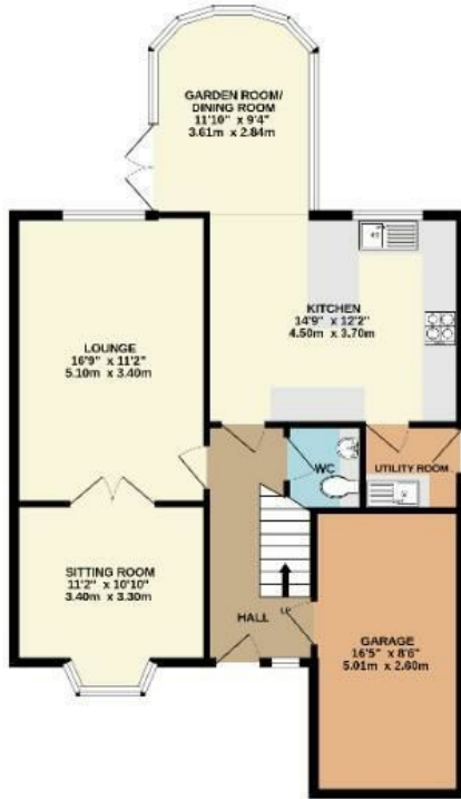
GROUND FLOOR 649 sq.ft. (78.9 sq.m.) approx.