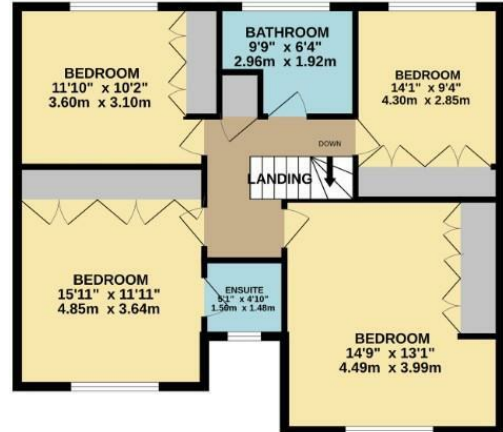
1ST FLOOR 771 sq.ft. (71.6 sq.m.) approx.