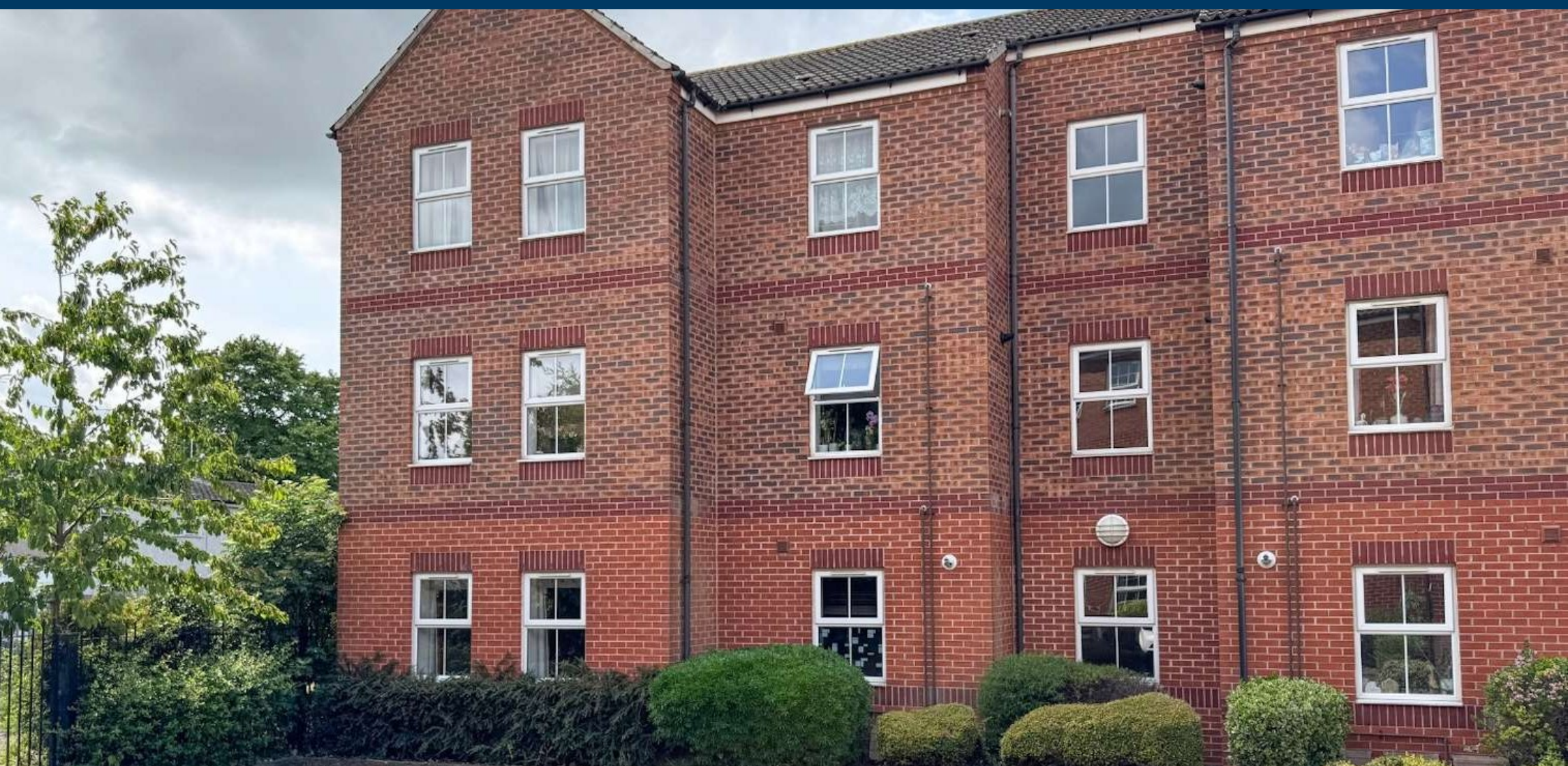
Barrows Gate, Newark