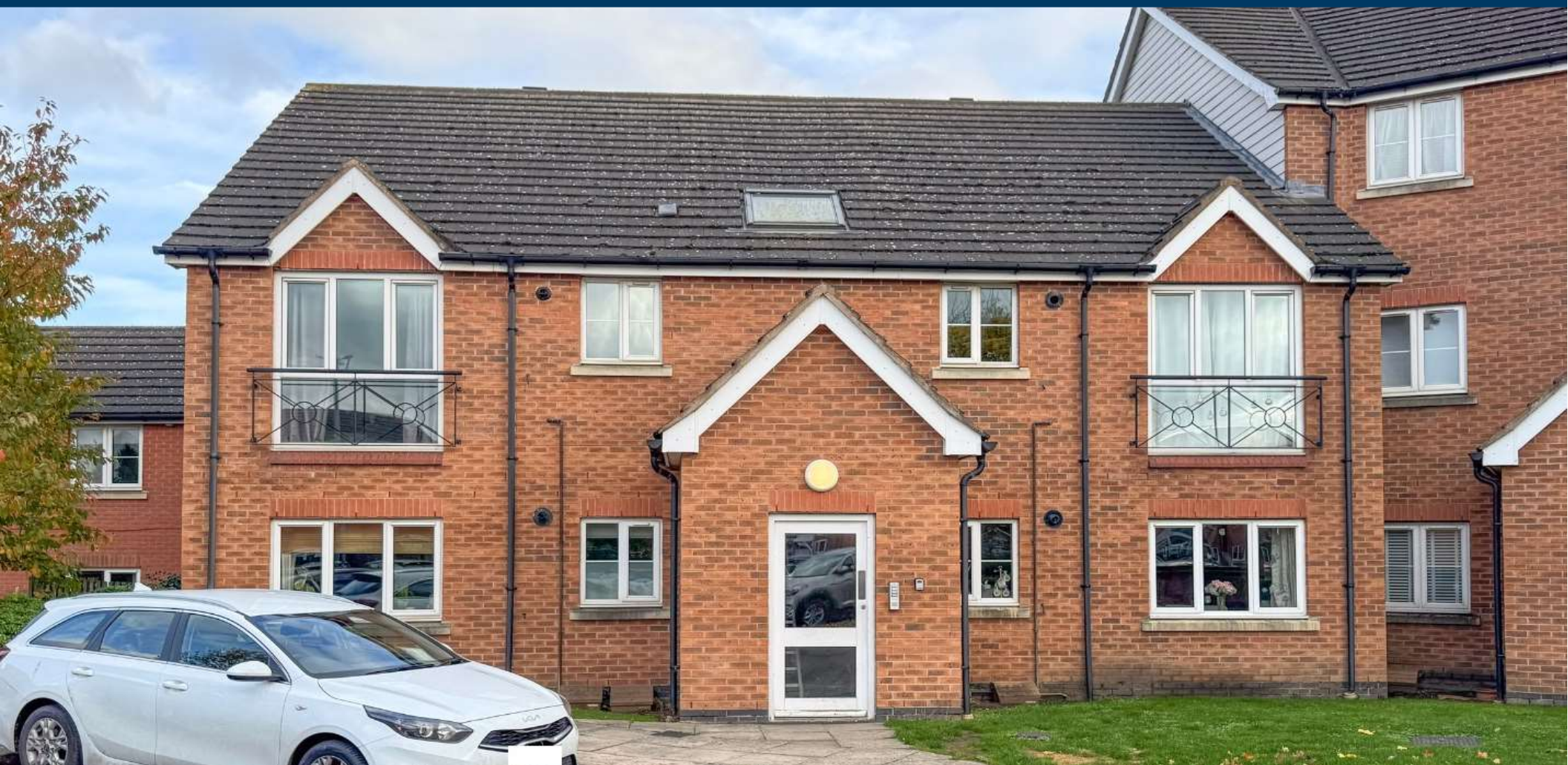
Apple Tree Close, Newark