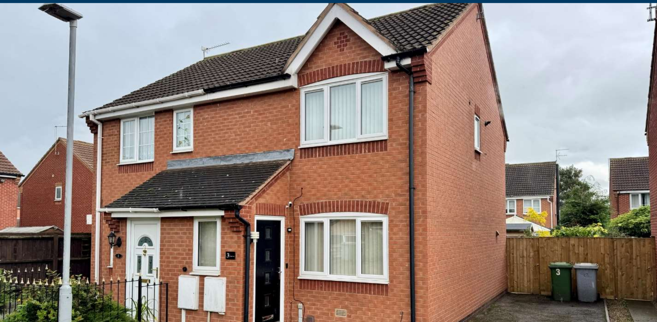
Pippin Court, Newark