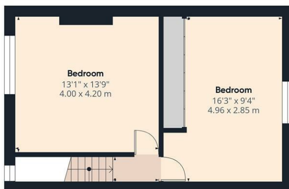
Landing 2'8" x 4'9" 0.81 x 1.45 m