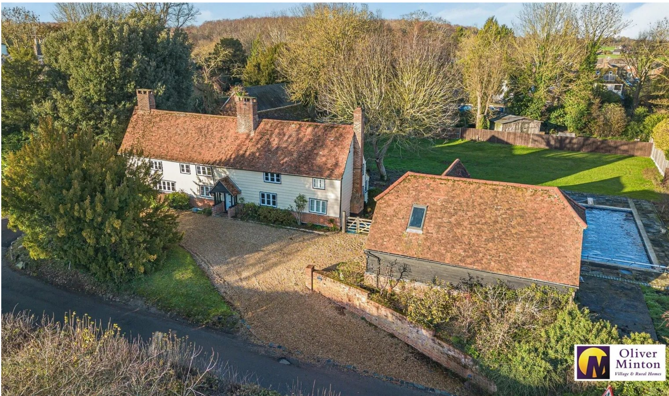
Chantry House, The Street, Furneux Pelham, Herts, SG9 0LJ £950,000 Freehold