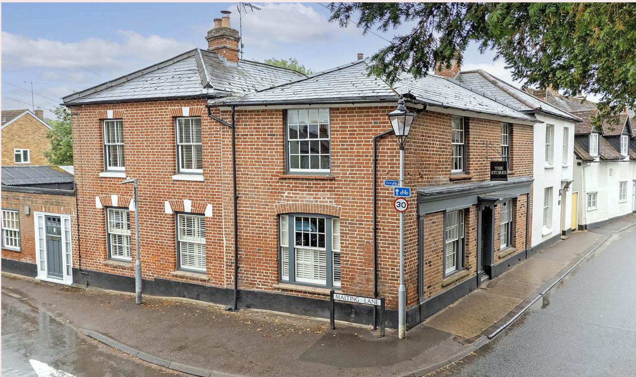
The Stores, Hadham Cross, Much Hadham, Herts SG10 6AL £825,000 Freehold