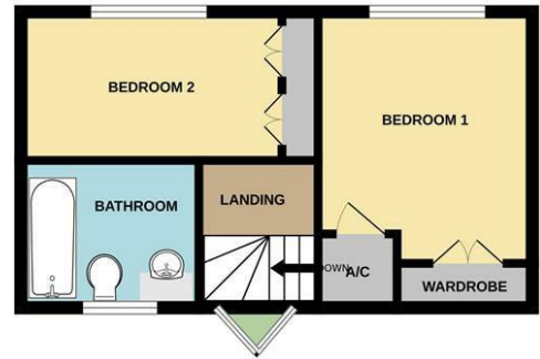
1ST FLOOR 307 sq.ft. (28.5 sq.m.) approx.