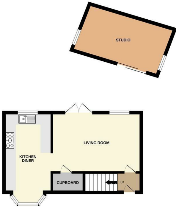
GROUND FLOOR 436 sq.ft. (40.5 sq.m.) approx.