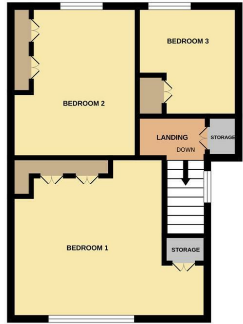
1ST FLOOR 414 sq.ft. (38.5 sq.m.) approx.