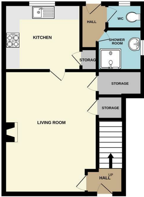
GROUND FLOOR 414 sq.ft. (38.5 sq.m.) approx.