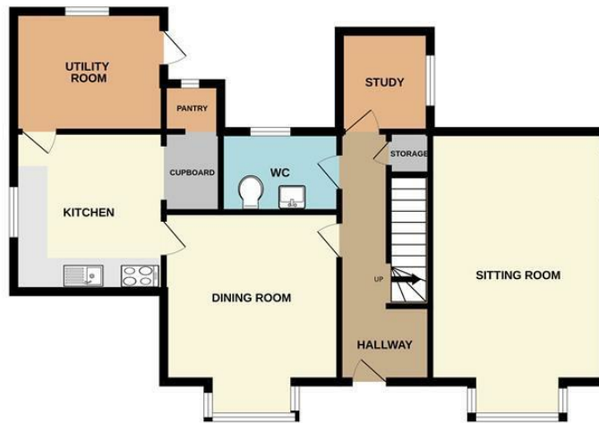
1ST FLOOR 609 sq.ft. (56.6 sq.m.) approx.