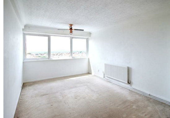
Bedroom One 16'0 x 10'0 (4.88m x 3.05m)