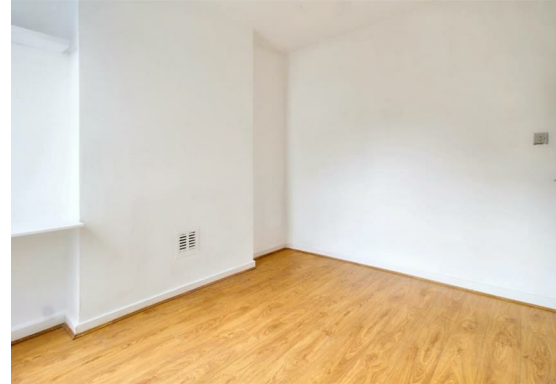
Open Plan Living / Kitchen 22'0 x 10'0 (6.71m x 3.05m)