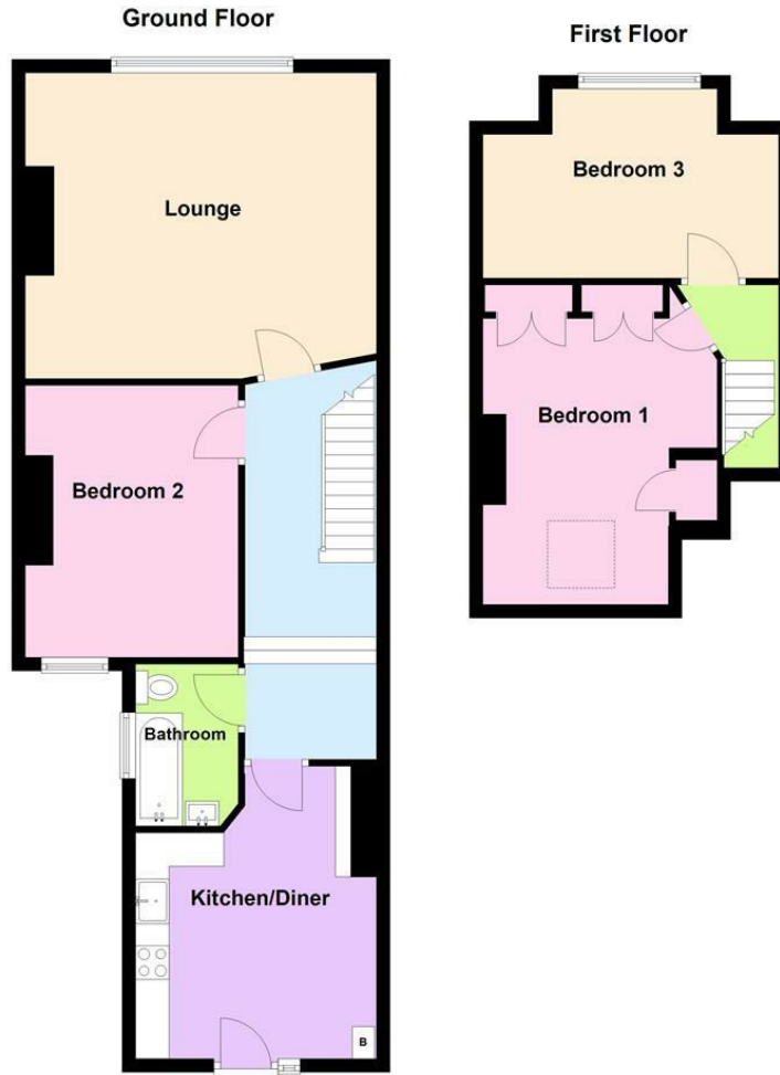
This floorplan is for illustration purposes only. The room sizes, locations of doors, windows and other features are approximate. Plan produced using PlanUp.