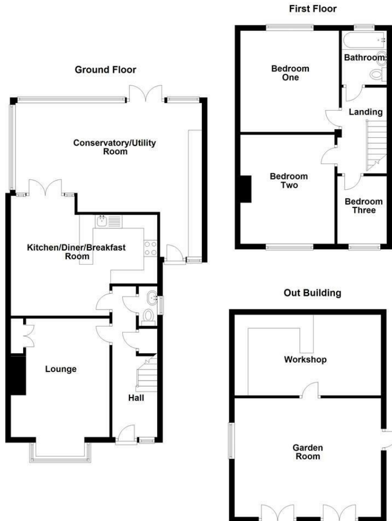
This floorplan is for illustration purposes only. The room sizes, locations of doors, windows and other features are approximate. Plan produced using PlanUp.