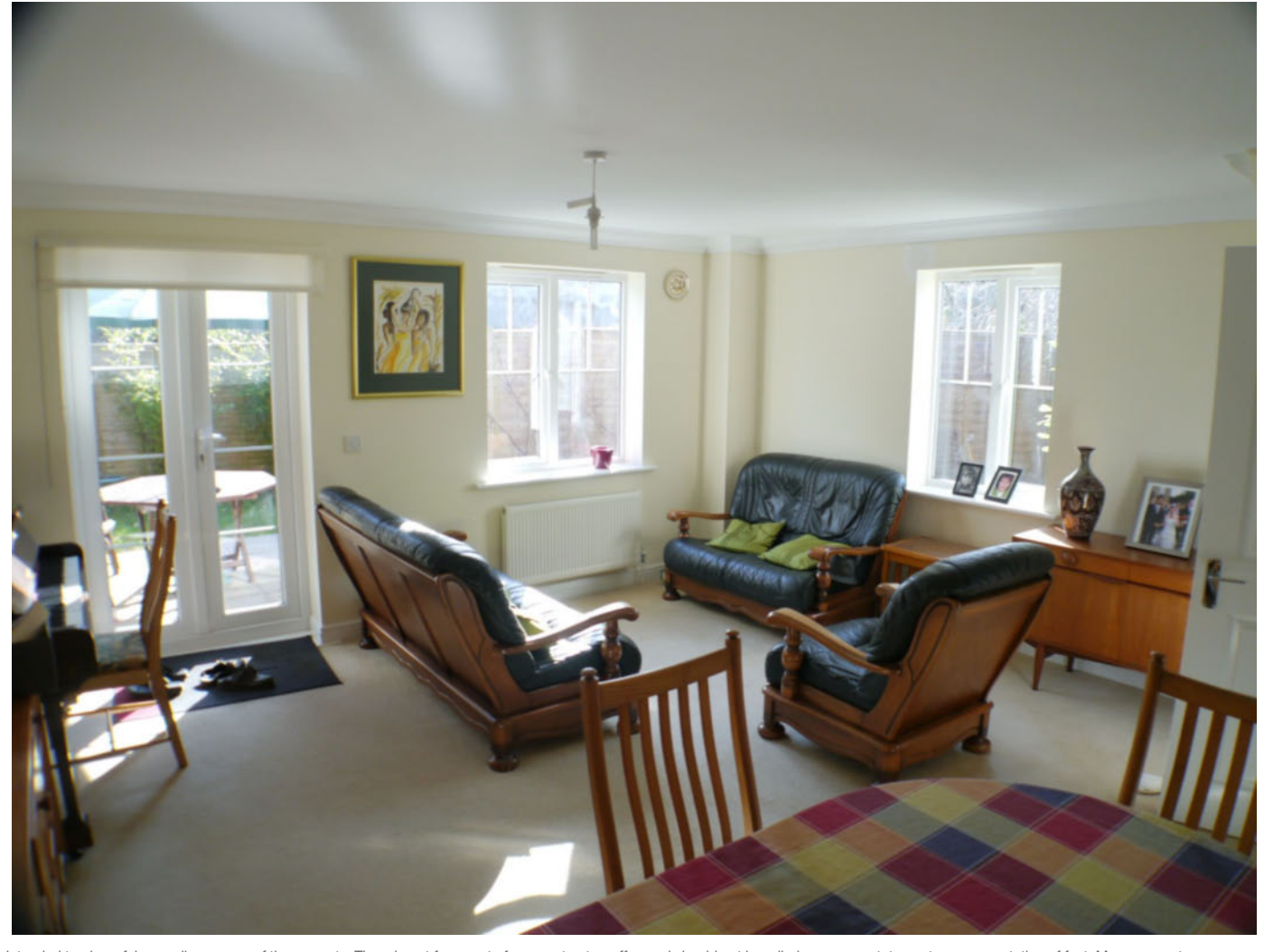
Agents Notes - We endeavour to make our particulars accurate and reliable. They are for guidance only and are intended to give a fair overall summary of the property. They do not form part of any contract or offer, and should not be relied upon as a statement or representation of fact. Measurements, areas and distances are approximate only. Photographs may include lifestyle shots and pictures of local views. Also there may be internal/external photographs including chattels not included with the property for sale. No undertaking is given as to the structural condition of the property, or any necessary consents or the operating ability or efficiency of any service, system or appliance. Intending purchasers must satisfy themselves with regard to each of these points. If there is any particular aspect of the property about which you would like further information, please contact us, especially before you travel to the property.