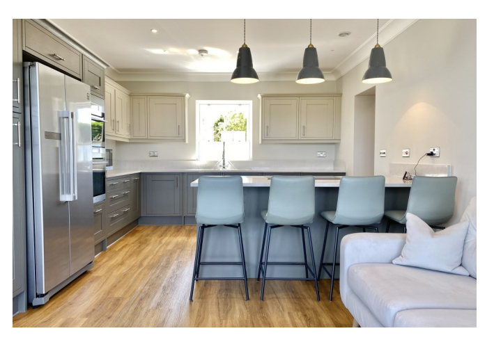
Tredower, Nr Treyarnon Bay PL28 8PR £2,250,000 guide

Externally, Tredower does not disappoint. From the Delabole slate hung external façade to the resin bound driveway with beautiful planted turning circle and gated entrance, the quality and appeal continues. To the rear of the property is a huge raised terrace enclosed by glass and stainless steel balustrade. Beyond is a large stock fenced level lawn followed by the enclosed paddock. All in all, the gardens, grounds and paddock constitute approximately three acres.