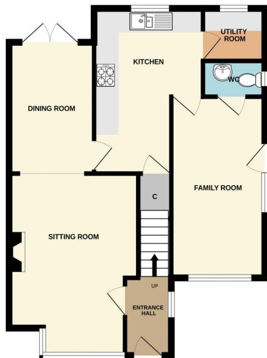
GROUND FLOOR 593 sq.ft. (55.1 sq.m.) approx.