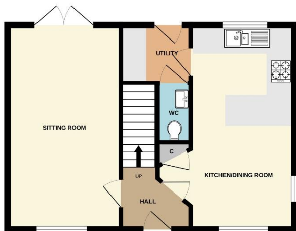
GROUND FLOOR 476 sq.ft. (44.3 sq.m.) approx.