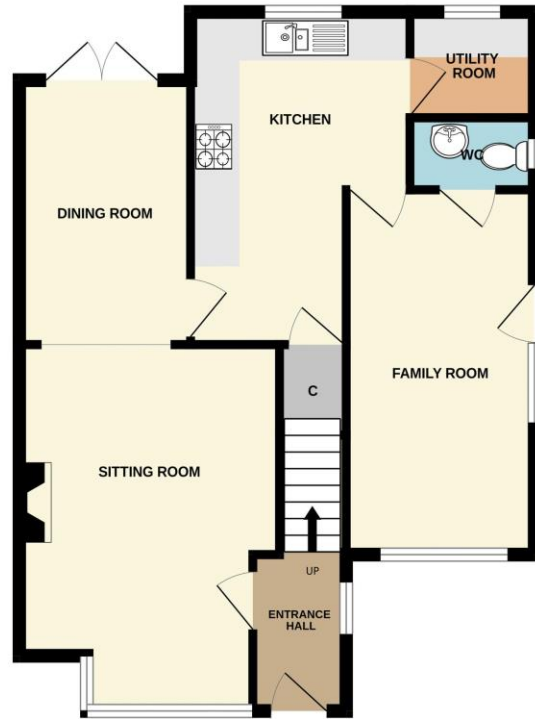
GROUND FLOOR 593 sq.ft. (55.1 sq.m.) approx.