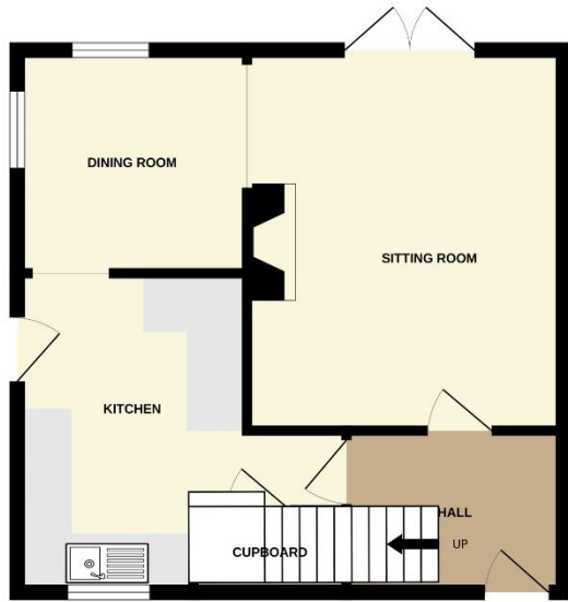
GROUND FLOOR 419 sq.ft. (39.0 sq.m.) approx.