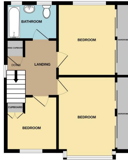
1ST FLOOR 462 sq.ft. (43.0 sq.m.) approx.