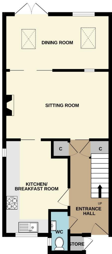
GROUND FLOOR 517 sq.ft. (48.0 sq.m.) approx.