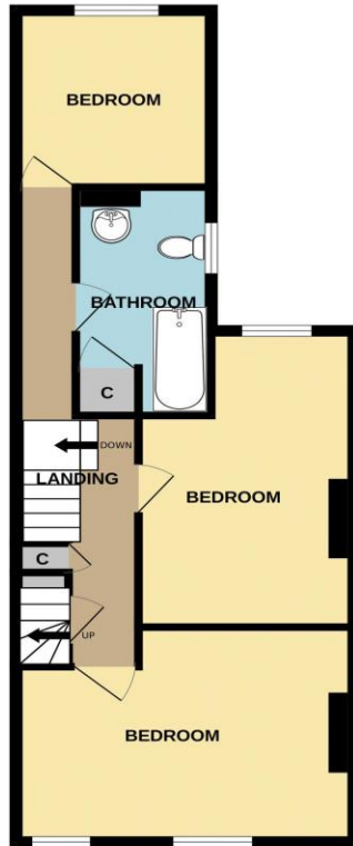
1ST FLOOR 538 sq.ft. (49.9 sq.m.) approx.