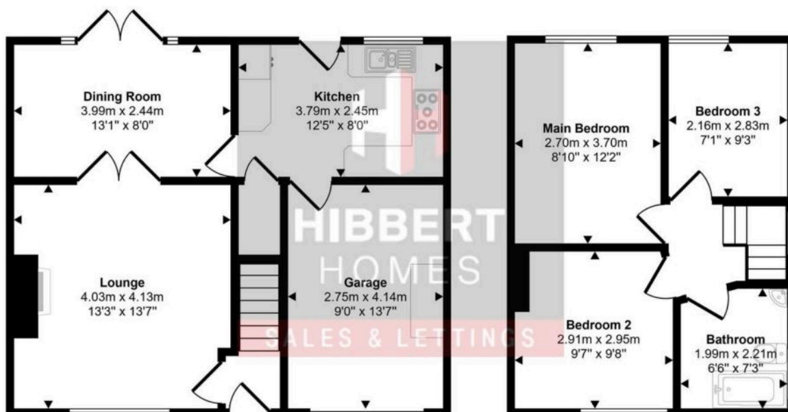
Ground Floor Approx 53 sq m / 571 sq ft

Approx Gross Internal Area 87 sq m / 938 sq ft