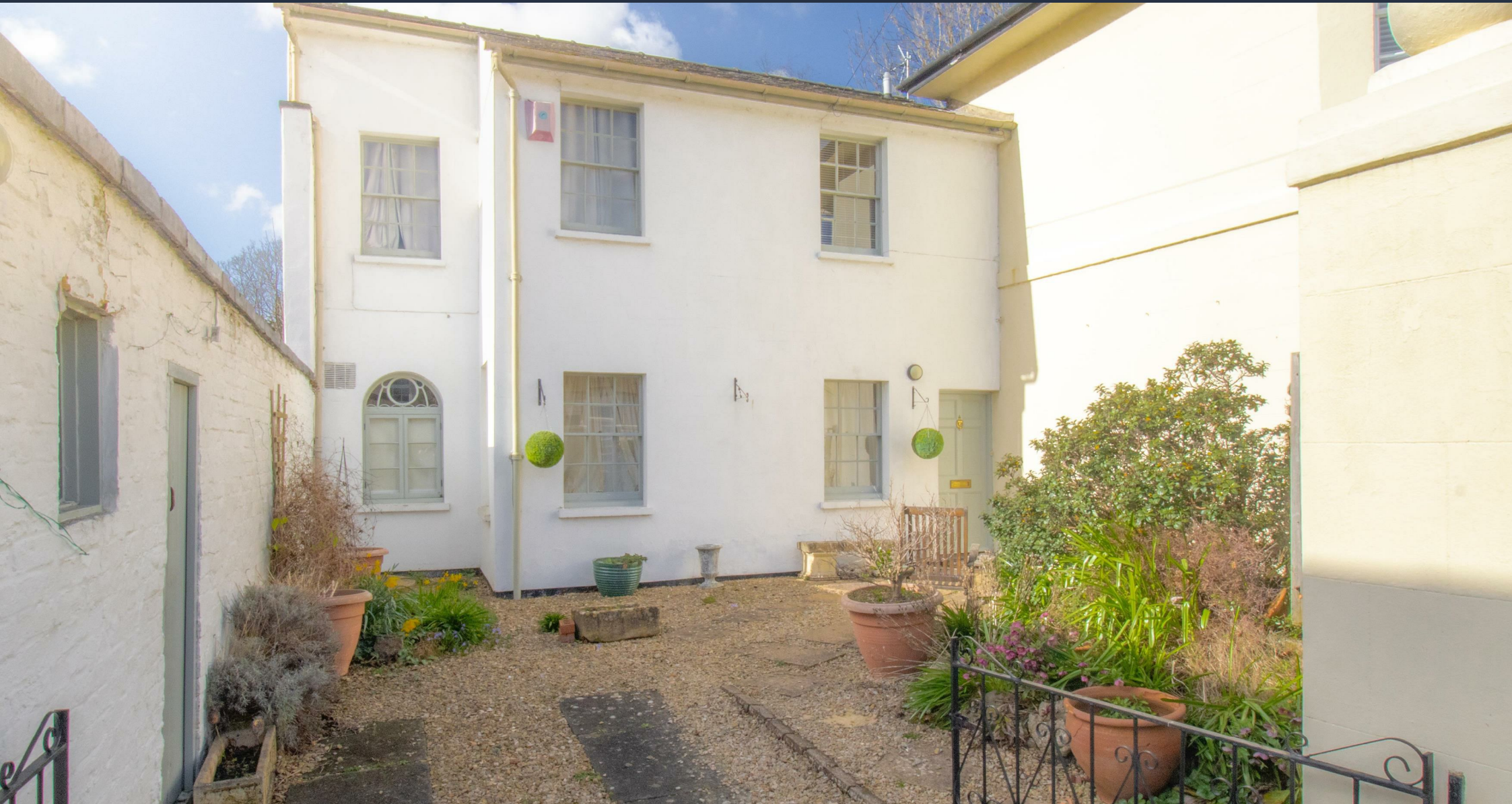
Bibury Cottage Priory Place, Cheltenham, GL52 6HG