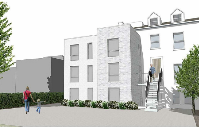
SED ARTIST IMPRESSION FROM REAR

HMT Sales & Lettings are delighted to offer an investor the opportunity to buy 17 Church Road which is currently made up of 4 x two bedroom apartments. There has been planning permission granted for an extension which will provide an additional 3 x two bedroom apartments, all with parking and a landscaped garden. There is also an exciting opportunity to build a one bedroom bungalow to the rear with its own parking and solar panels with permission already granted.