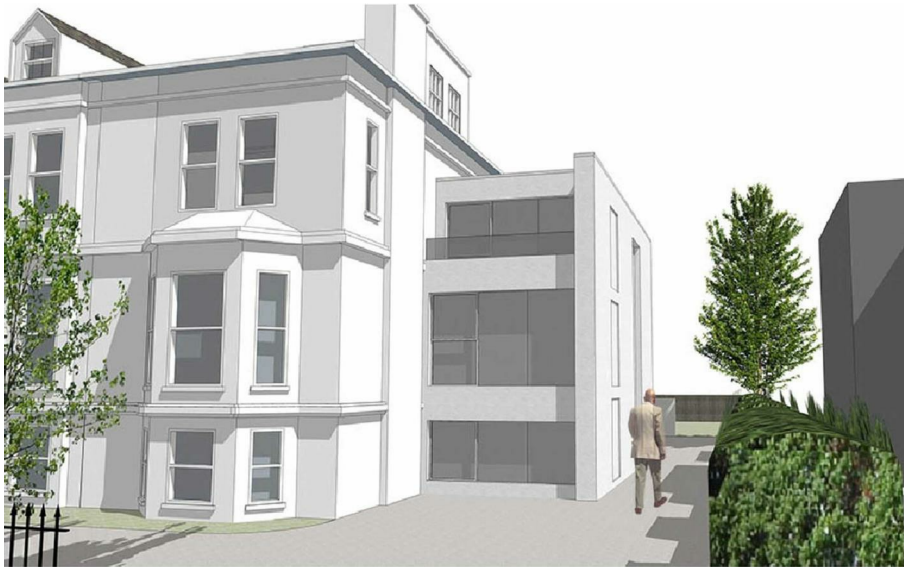
SED ARTIST IMPRESSION FROM FRONT [CHURCH ROAD]

HMT Sales & Lettings are delighted to offer an investor the opportunity to buy 17 Church Road which is currently made up of 4 x two bedroom apartments. There has been planning permission granted for an extension which will provide an additional 3 x two bedroom apartments, all with parking and a landscaped garden. There is also an exciting opportunity to build a one bedroom bungalow to the rear with its own parking and solar panels with permission already granted.