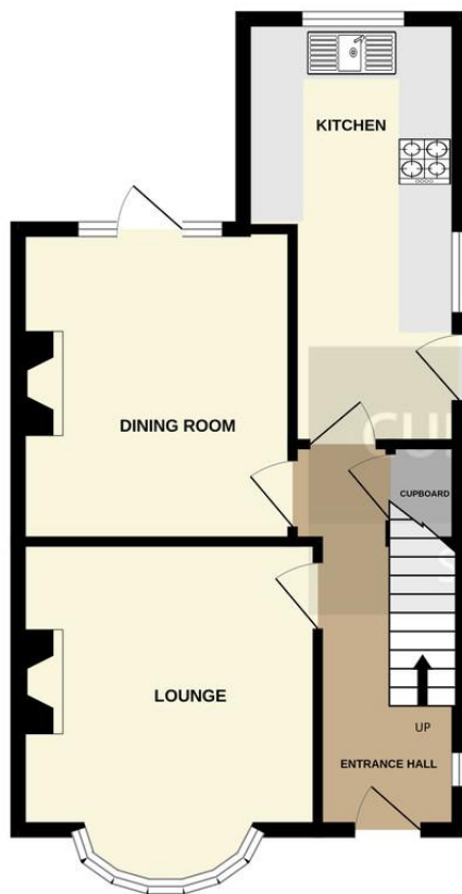
GROUND FLOOR 451 sq.ft. (41.9 sq.m.) approx.