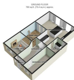
GROUND FLOOR 790 sq.ft. (73.4 sq.m.) approx.