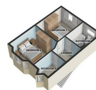
1ST FLOOR 381 sq.ft. (35.4 sq.m.) approx.

TOTAL FLOOR AREA : 1171 sq.ft. (108.8 sq.m.) approx.