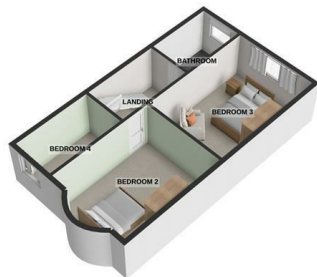
1ST FLOOR 525 sq.ft. (48.8 sq.m.) approx.