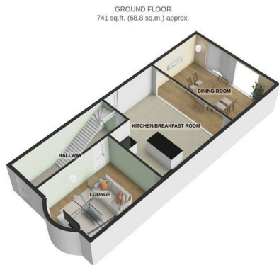
GROUND FLOOR 741 sq.ft. (68.8 sq.m.) approx.