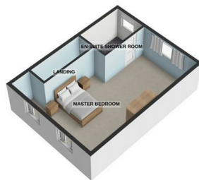
2ND FLOOR 403 sq.ft. (37.4 sq.m.) approx.

TOTAL FLOOR AREA : 1669 sq.ft. (155.1 sq.m.) approx.