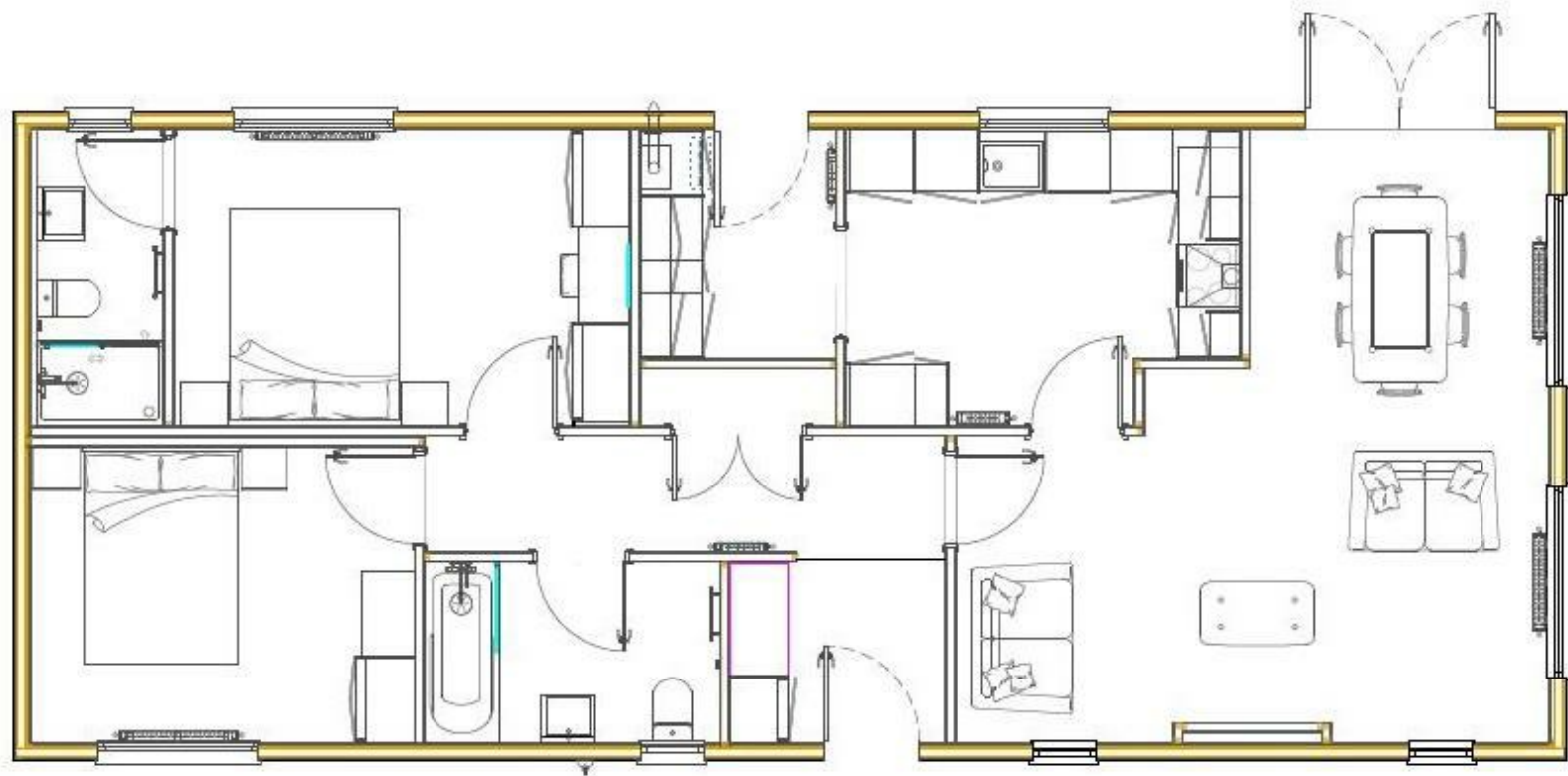
Forest Way, Golden Cross