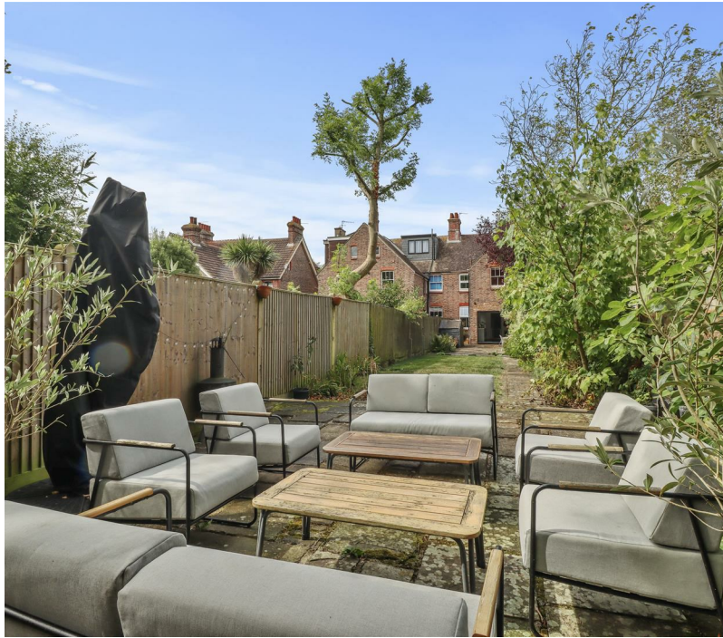
Summerheath Road, Hailsham