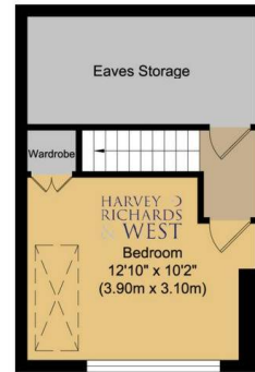
Second Floor Approximate Floor Area 224.00 sq. ft. (20.80 sq. m)

TOTAL APPROX FLOOR AREA 876.00 SQ. FT. (AREA 81.40 SQ. M)