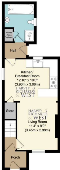
Ground Floor Approximate Floor Area 378.00 sq. ft. (35.20 sq. m)