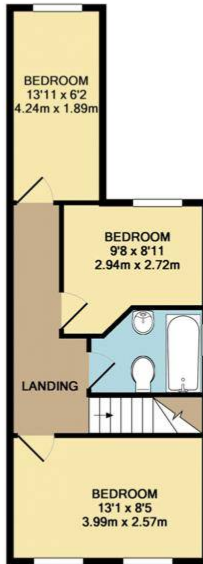
1ST FLOOR APPROX. FLOOR AREA 395 SQ.FT. (36.7 SQ.M.)

TOTAL APPROX. FLOOR AREA 680 SQ.FT. (63.2 SQ.M.)