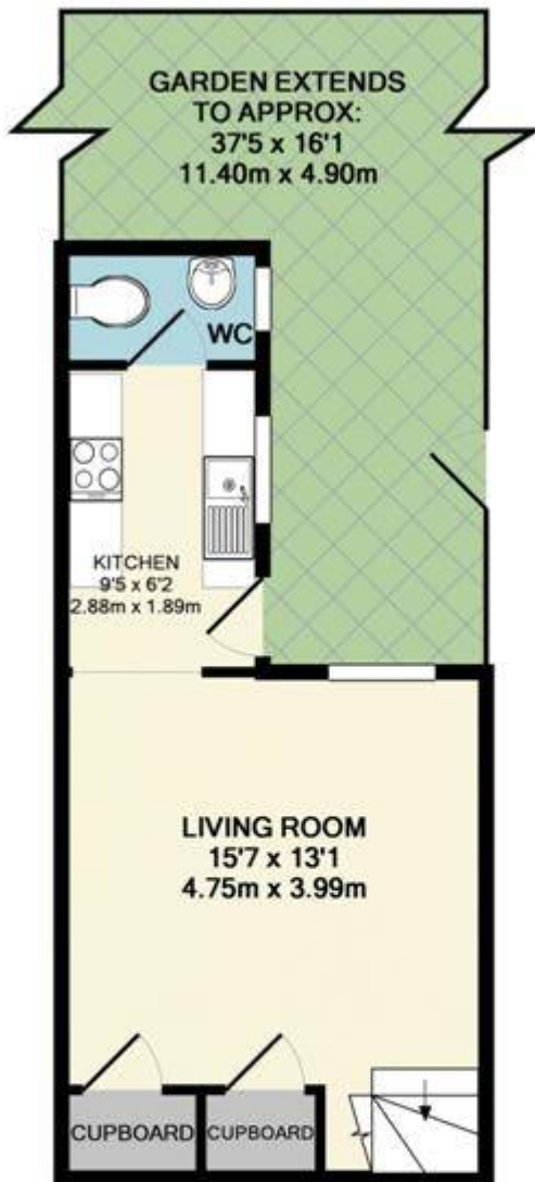
GROUND FLOOR APPROX. FLOOR AREA 285 SQ.FT. (26.5 SQ.M.)