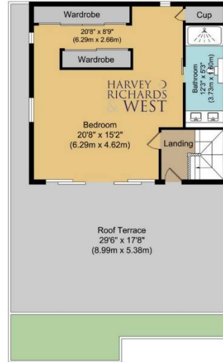
Second Floor Approximate Floor Area 626.99 sq. ft. (58.25 sq. m)