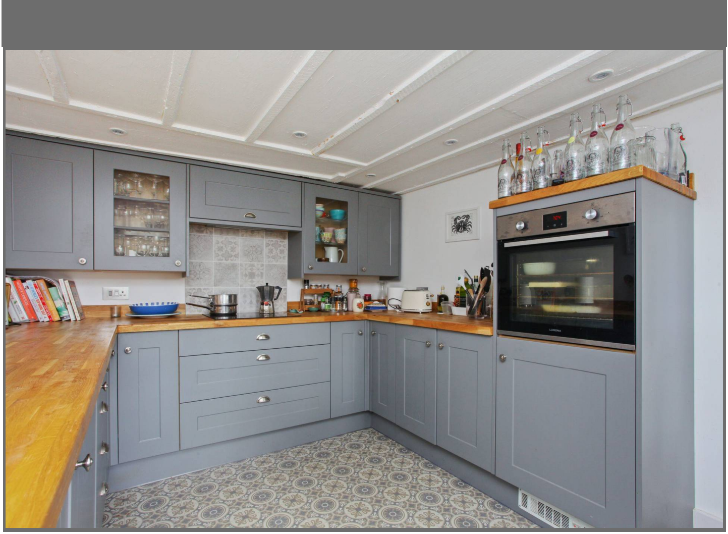
Borstal Hill, Whitstable