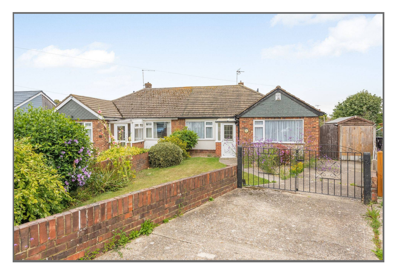
Marine Crescent, Whitstable, CT5

Wonderful two bedroom semi-detached bungalow located just round the corner from Tankerton Slopes with the added benefit of off street parking.