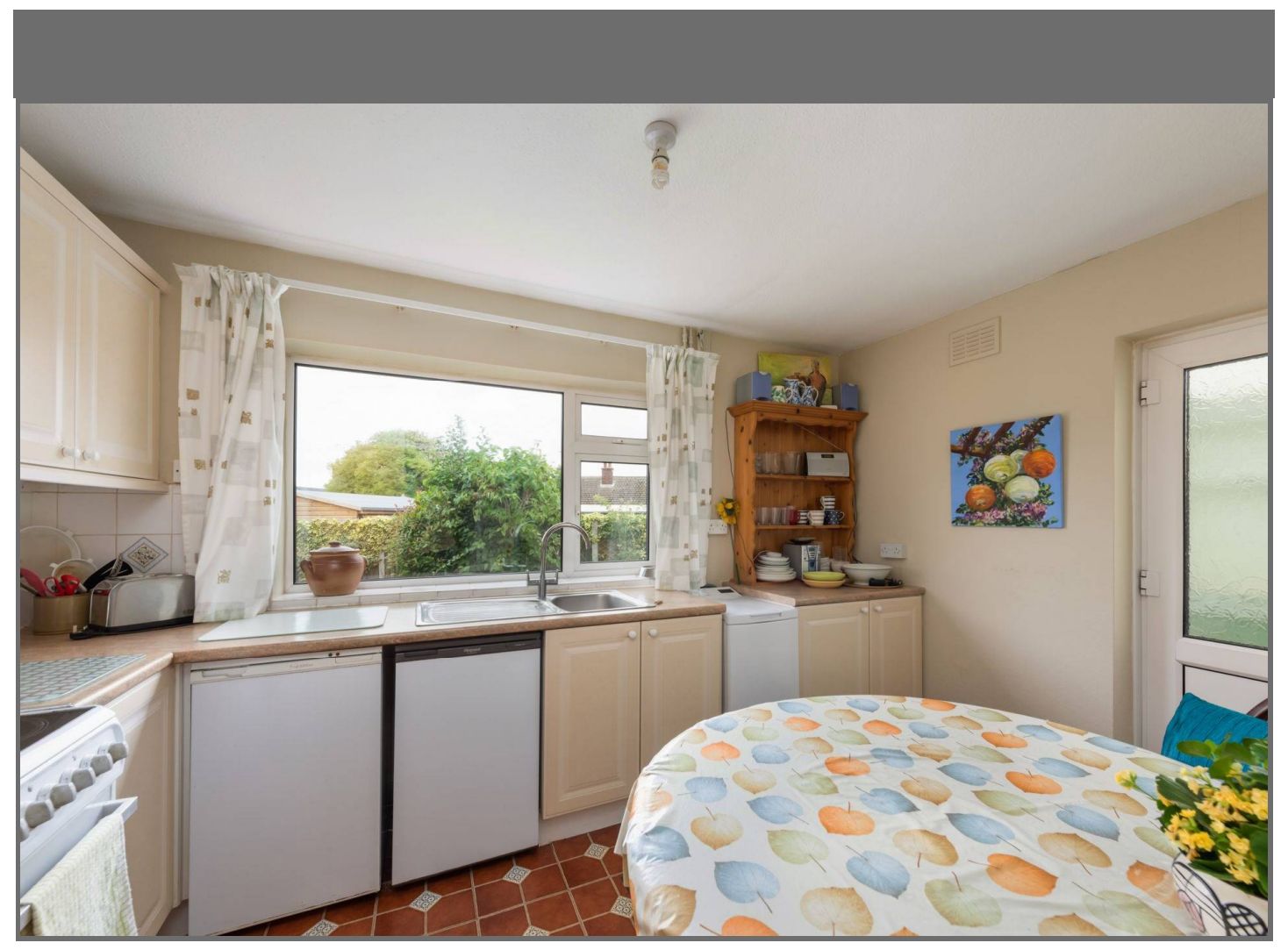
Marine Crescent, Whitstable