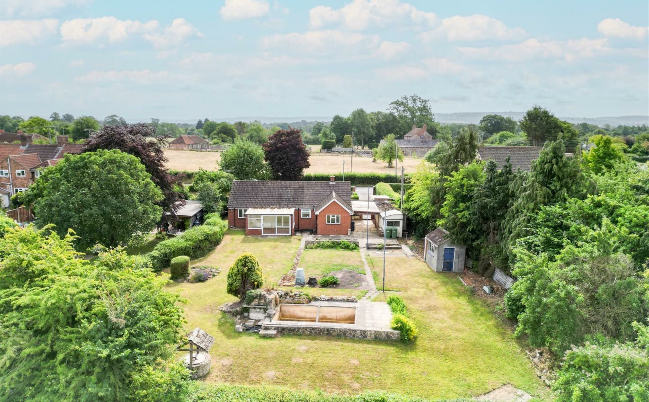
Armored Bungalow, Wanswell, Berkeley GL13 9SB