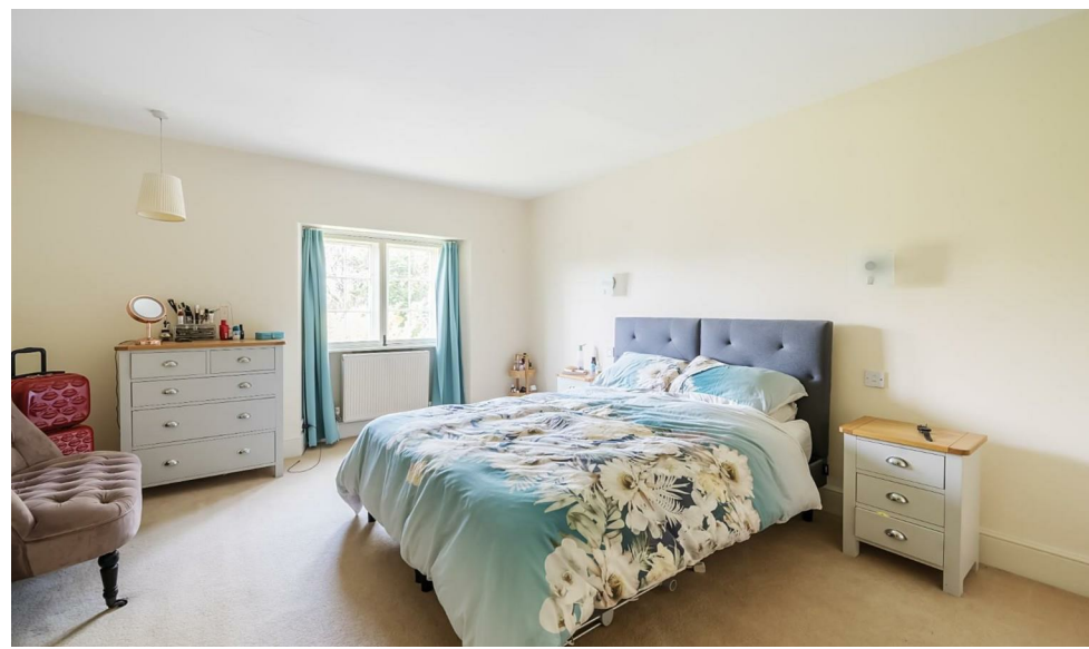
Cottage Bedroom One