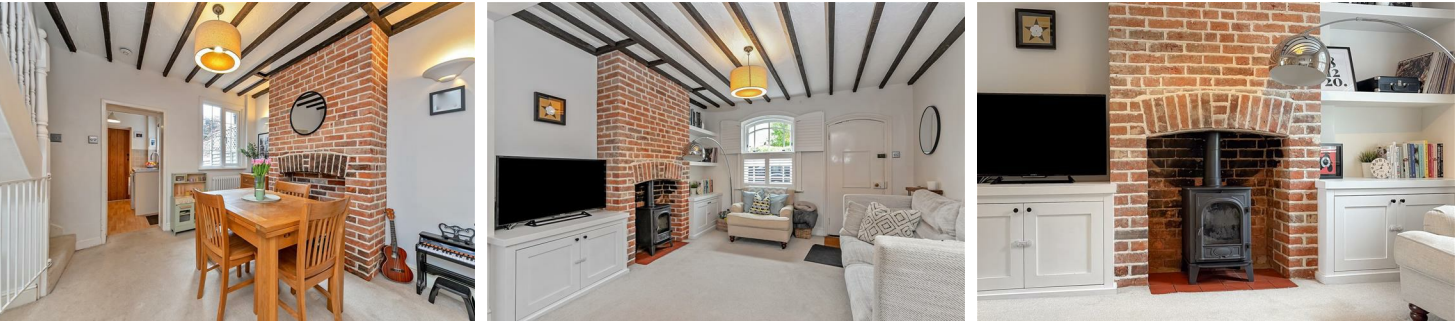
Ground Floor Approx. 398.9 sq. feet

A charming three bedroom Victorian terraced cottage which has been modernized to create a comfortable home. The property has a subtle blend of both original character features alongside modern day benefits such as double-glazed sash windows and a cast iron log burning stove. The high street and Marford playing fields are only a short walk away. Wheathampstead is a thriving village surrounded by rolling countryside yet close to all major communication links including the Thameslink railway station less than three miles away in Harpenden. There are three primary schools within the village. The new Katherine Warington senior school is less than three miles away.